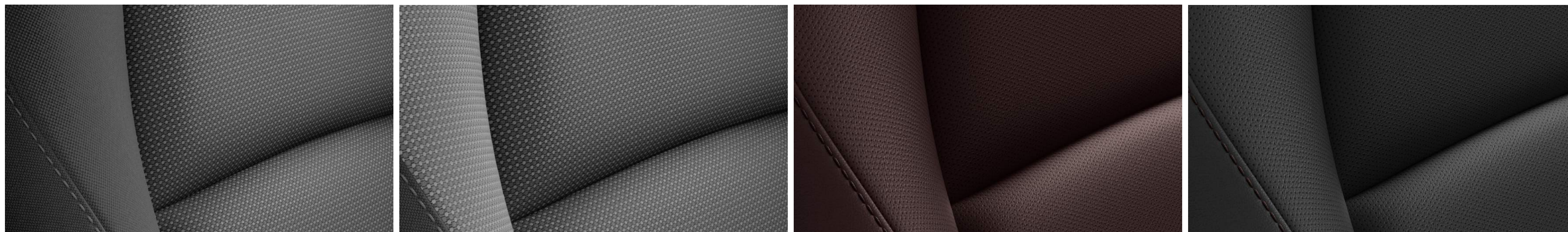
Black cloth (Pure)