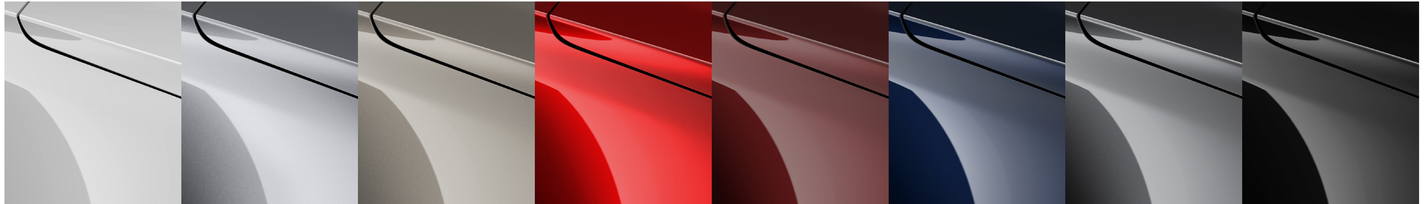
Rhodium White Metallic~